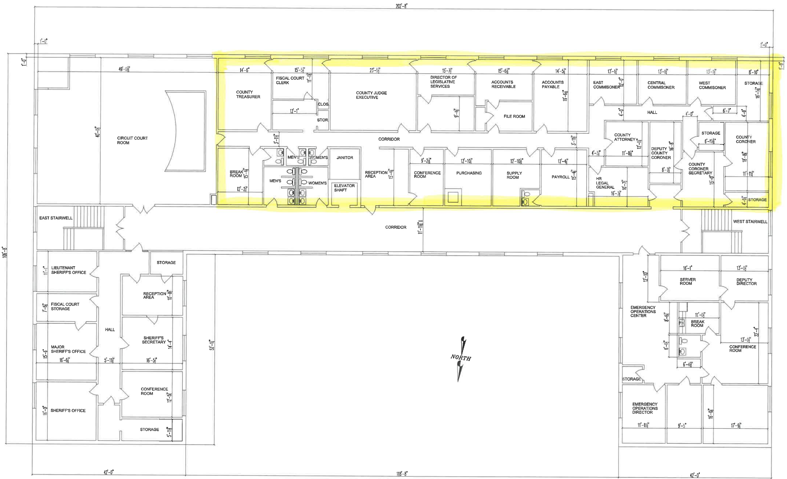
DAVIESS COUNTY COURT HOUSE SECOND FLOOR PLAN

S&S DETAILING, LLC Structural Steel-ASME Pressure Vessels Stairs-Handrails-Caged Ladders 4509 Remington Way Owensboro, KY 42301 270-993-7494 structuraldetailer@outlook.com